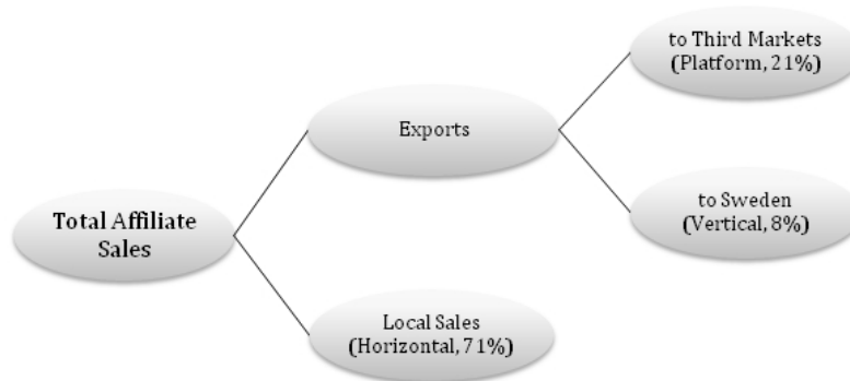
Figure 2: SALE COMPOSITION OF SWEDISH MNEs: ALL NEWLY ESTABLISHED AFFILIATES, 1987-1998

affiliate operate as a production company of another group before the year mentioned above? (4) Was the affiliate a state-owned company before the year mentioned above? If the answers to last three questions are all negative, then the investment is classified as a greenfield FDI. If the answer to question 3 is affirmative, then it is a cross-border M&A. 12